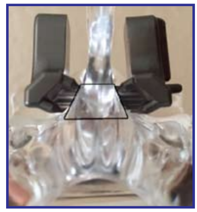
Fig. 3 - Thicker cortex anteriorly